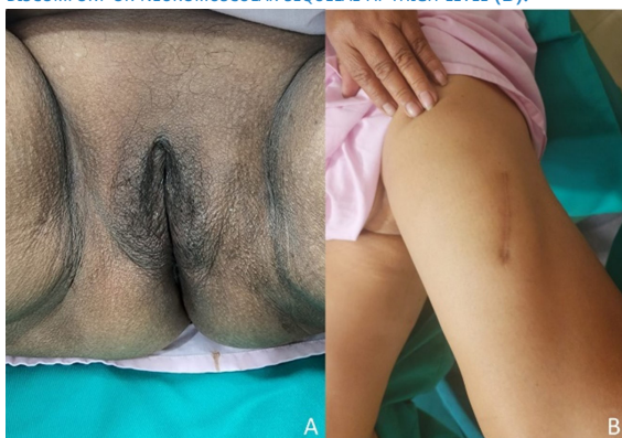
FIGURE 4. CONTROL AT ONE YEAR AFTER SURGERY (A), WITHOUT URINARY DISCOMFORT OR NEUROMUSCULAR SEQUELAE AT THIGH LEVEL (B).