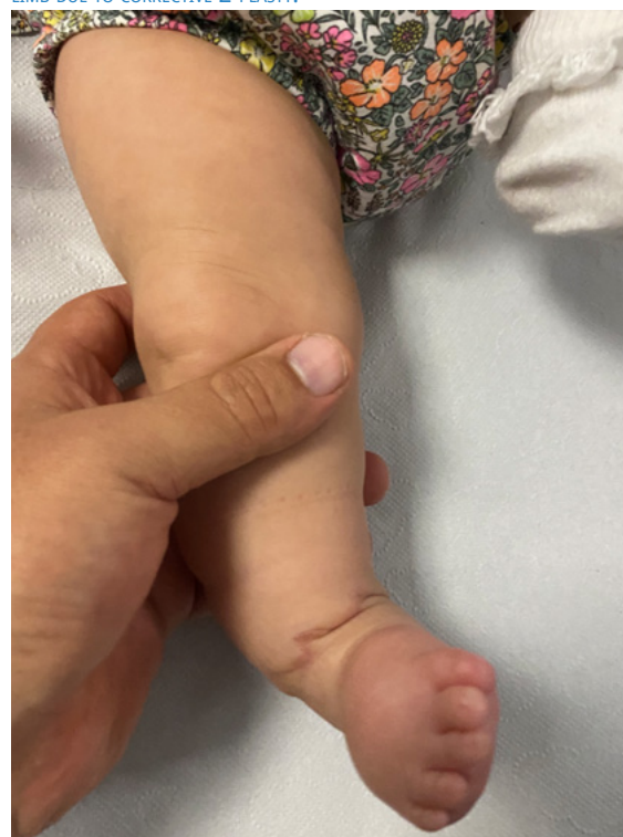
FIGURE 9. POSTNATAL CONTROL: SCAR IS VISUALIZED IN THE RIGHT LOWER LIMB DUE TO CORRECTIVE Z-PLASTY.

At 12 months of age, she underwent a final Z-plasty type plastic surgery at the abdominal level, the evolution of which was favorable, as well as her general growth and psychomotor development.