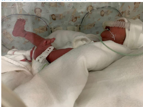
FIGURE 8. NEONATAL CONTROL, SHOWING THE MARK ON THE SKIN OF THE LOWER LIMB WITH RESIDUAL BONE DEFORMITY.

X-ray of the lower limbs showed no evidence of fracture, but did show deformity (arching at the level of the distal third of the right lower limb).