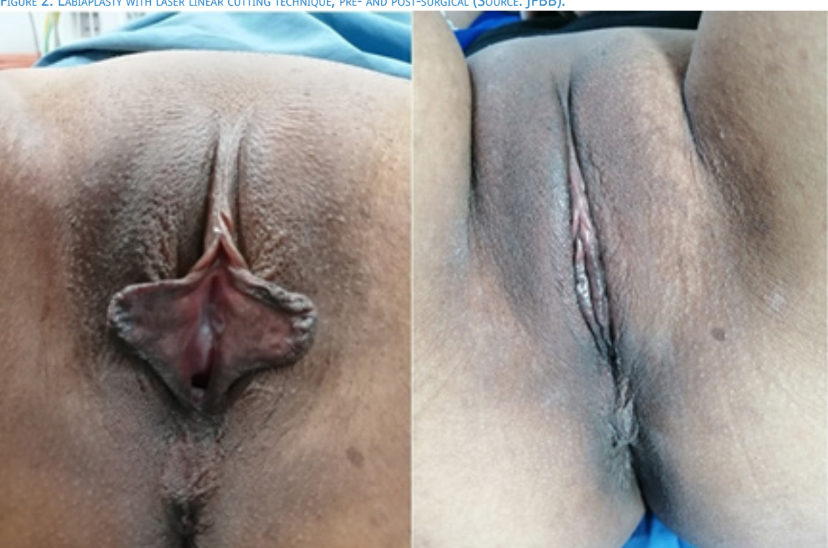
FIGURE 2. LABIAPLASTY WITH LASER LINEAR CUTTING TECHNIQUE, PRE- AND POST-SURGICAL.

Inclusion criteria were: female gender, esthetic or functional nonconformity with their external genitalia, congenital abnormalities or secondary to obstetric trauma, and previous unsatisfactory cosmetic surgeries. Exclusion criteria were if the women had records with relevant loss of information, women with body dysmorphic disorder or if they refused to undergo the intervention. After consecutive sequential sampling, 713 records were obtained. No cases were withdrawn; all were included in the analysis and were useful for the study.