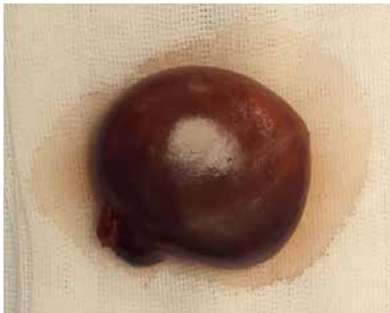
FIGURE 5. LEFT OVARIAN CYST WITH TORSION, WEIGHING 14 G AND MEASURING 4.5 x 3.0 x 3.0 CM.

In order to evaluate the torsion of a fetal ovarian cyst in abdomen (not in pelvis), measuring the peduncle is more effective than measuring the cyst's diameters. However, these values have to be obtained by abdominal ultrasound of the patient, which is a complex, unavailable technique in the antenatal period (5) .