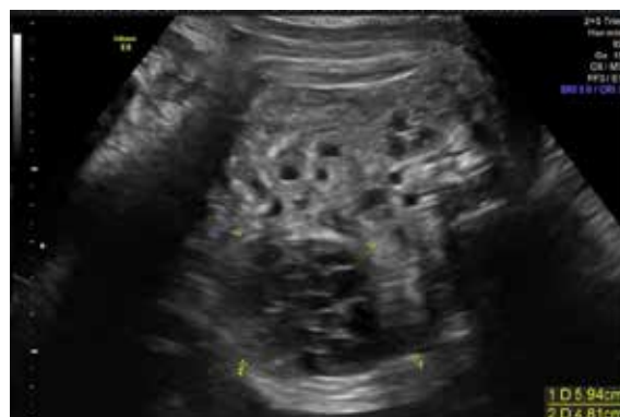
FIGURE 4. ABDOMINAL TUMOR IN LEFT FLANK HAD GROWN TO 5.53 X 4.52 CM AT 33.3 WEEKS GESTATION

Within the first 24 hours after birth, an abdominal ultrasound of the newborn revealed a septated cystic mass in the left lower quadrant, which was diagnosed as probable meconium peritonitis. A CT scan showed an abdominal mass with